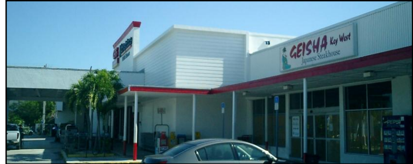
CONCH PLAZA SHOPPING CENTER