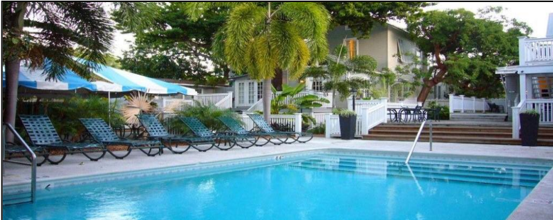
CHELSEA HOUSE & RED ROOSTER GUESTHOUSE $9,900,000 TRANSACTION