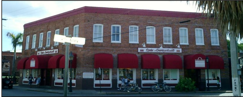
HOG'S BREATH SALOON BUILDING