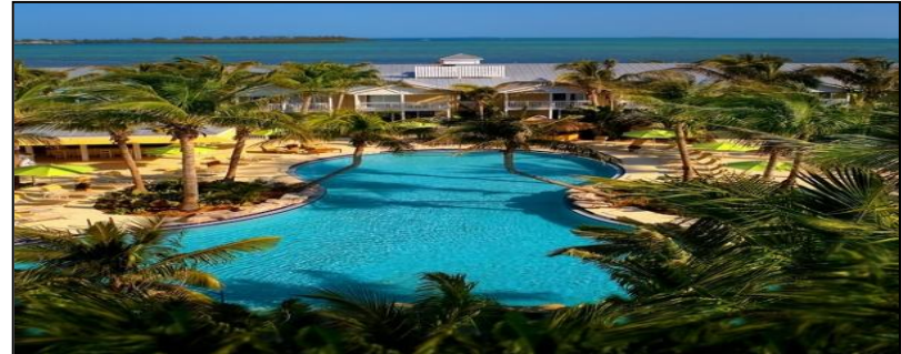
RAMADA INN KEY WEST/ INN AT KEY WEST $8,875,000 TRANSACTION

THE ARTIST HOUSE GUESTHOUSE THE ISLANDER RESORT ISLAMORADA DAYS INN KEY WEST FARO BLANCO RESORT & MARINA MARATHON