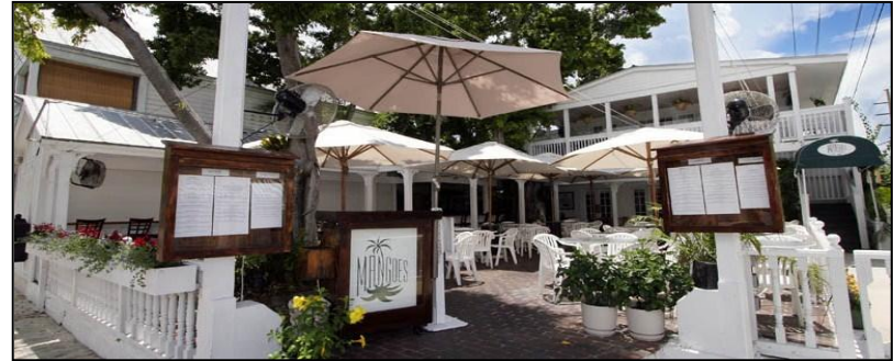
MANGOES RESTAURANT & CATERING