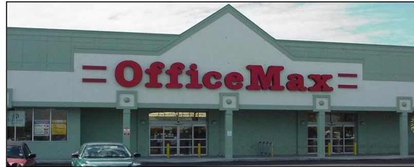
KEY PLAZA SHOPPING CENTER EXCLUSIVE LEASING AGENTS SINCE 1998