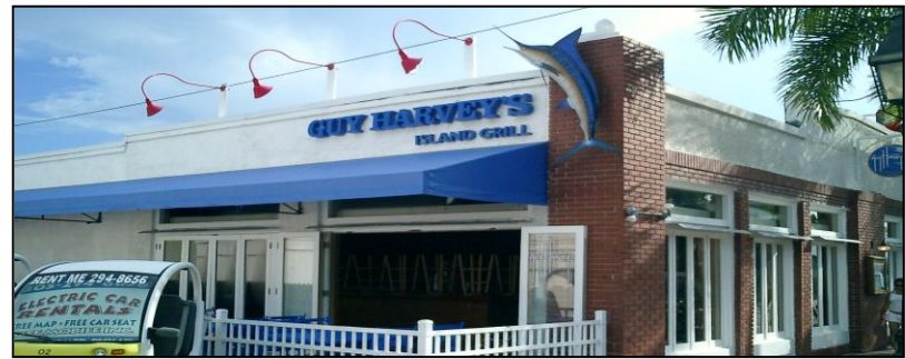
GUY HARVEY'S ISLAND GRILL