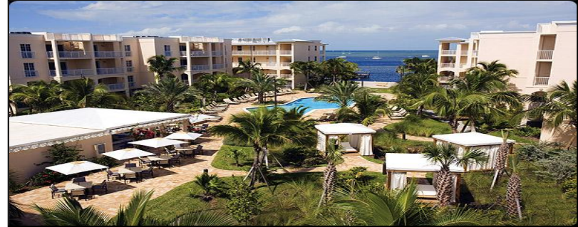
HOLIDAY INN BEACHSIDE/ MARRIOTT BEACHSIDE $17,170,000 TRANSACTION