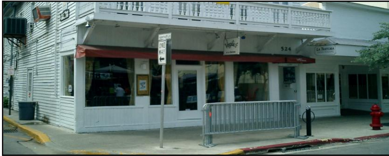
LA TRATTORIA RESTAURANT AND VIRGIlios