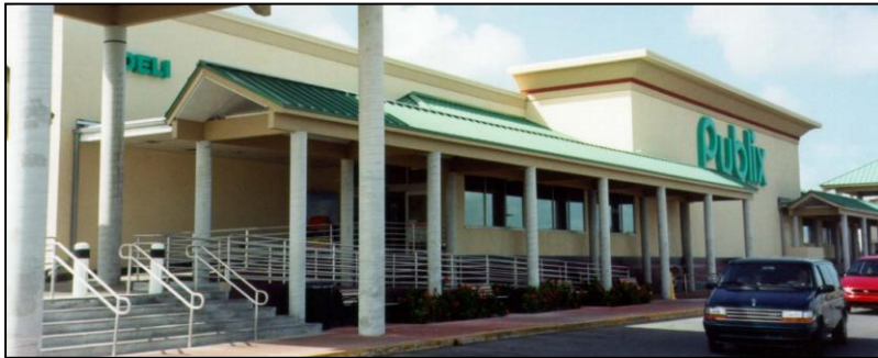
SEARSTOWN SHOPPING CENTER EXCLUSIVE LEASING AGENTS SINCE 1995