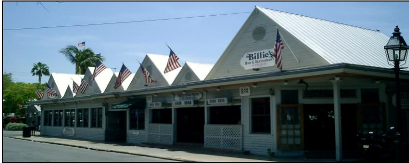
BILLIES BAR & RESTAURANT