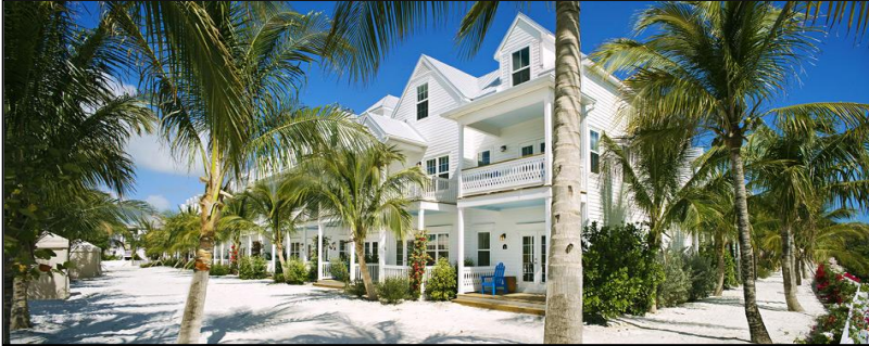
HAMPTON INN KEY WEST/ PARROT KEY RESORT $35,000,000 TRANSACTION