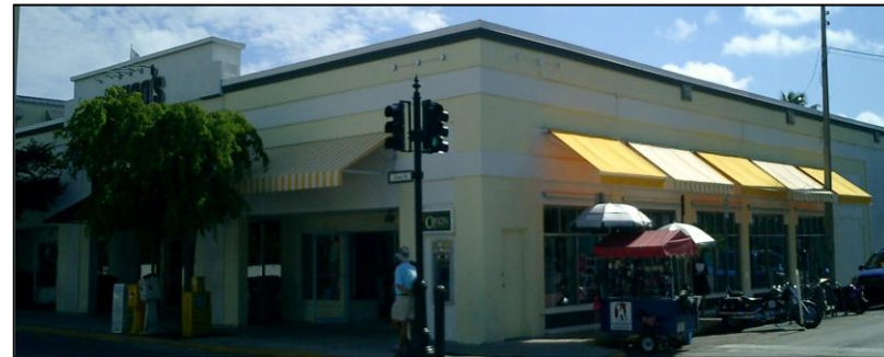
400-408 DUVAL STREET CENTER EXCLUSIVE LEASING AGENT SINCE 2007

OUTBACK STEAKHOUSE H & R BLOCK PIER 1 IMPORTS ECKERD DRUGS/ CVS WAFFLE HOUSE DOLLAR TREE STORES