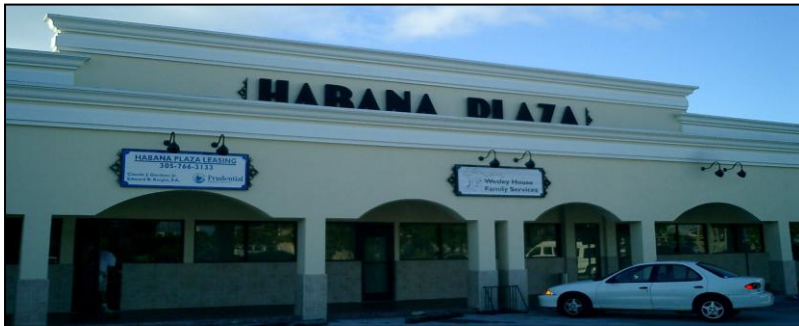
HABANA PLAZA SHOPPING CENTER EXCLUSIVE LEASING AGENT SINCE 2007